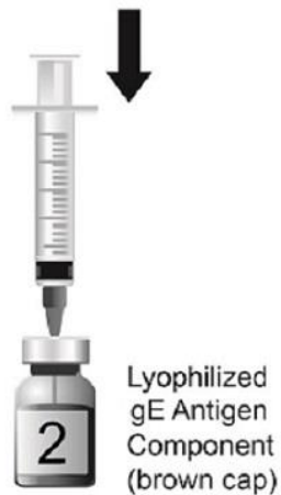
Figure 2. Slowly transfer entire contents of syringe into the lyophilized gE antigen component vial (brown cap). Vial 2 of 2.