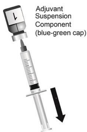
Figure 1. Cleanse both vial stoppers. Using a sterile needle and sterile syringe, withdraw the entire contents of the vial containing the adjuvant suspension component by slightly tilting the vial (blue-green cap). Vial 1 of 2.

products should be inspected visually for particulate matter and discoloration prior to administration, whenever solution and container permit. If either of these conditions exists, the vaccine should not be administered.